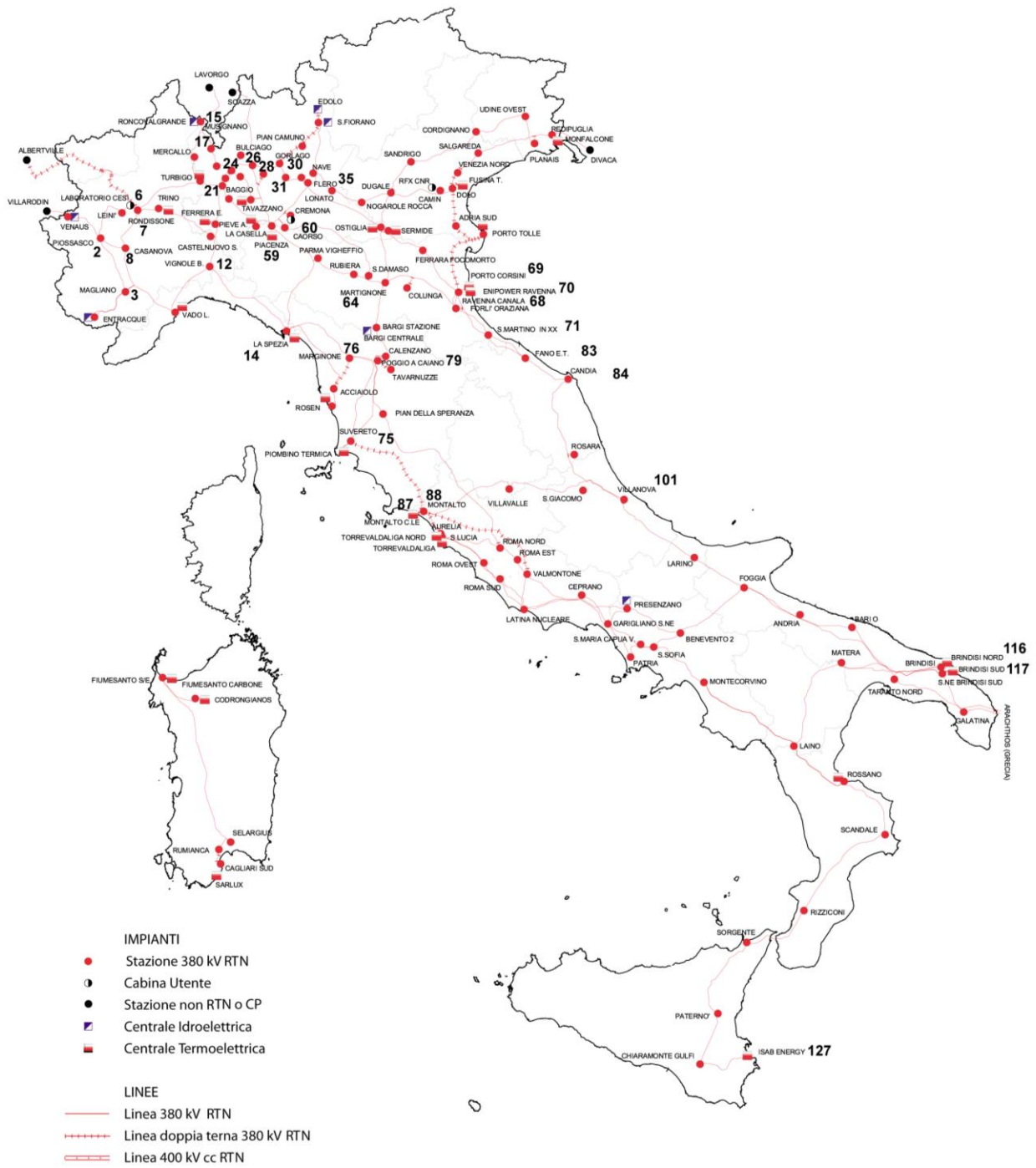
Figure 1. The 380 kV Italian power transmission network (21,22) .