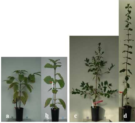
Figure 1. Habit of Coffea canephora (CAN): (a) control plant, (b) plant without branch; and Coffea racemosa (RAC): (c) control plant; (d) plant without branch. Photographies December 2008.

with the leaf and axillary production). Plant topology was recorded following MTG formalism [2] using Xplo software ( http://amapstudio.cirad.fr/ ). For each phytomer, the length of the underlying internode, the presence of branches and leaves were recorded. Each leaf was cut, weighed and scanned. Leaf areas were estimated by analyzing the images with Taoster (plug-in implemented in ImageJ freeware [3]). The plant axes were cut internode by internode. The fresh mass of each phytomer (stem and leaves have been separated) was recorded.