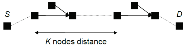
Fig. 2. Spatial-reused cooperative multihop network with M = 2 .

For the first M - 1 phases, we repeat the non-cooperative transmission described above for the n th relay, 1 \leq n < M - 1 to retransmit the source data. After initial stages, the cooperative transmission is utilized for routing the source packets to the destination. In contrast to [1] where transmitters