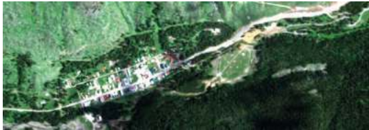
Figure 1. Color rendering of self test hyperspectral image.

They have been passed through a Hilbert filter to render them complex. After sampling, the vector is of dimension m = 10 and the parameters estimation is performed locally using a sliding window of size seven, and N = 48 . Once the P_{fa} has been fixed again at 10^{-3} , we place artificial targets over the image. We compare in Fig. 3 the outcome of the different detection tests. Note that the use of the Fixed Point estimators jointly with the ANMF lead to the best performance results, while AMF presents the highest SNR requirements.