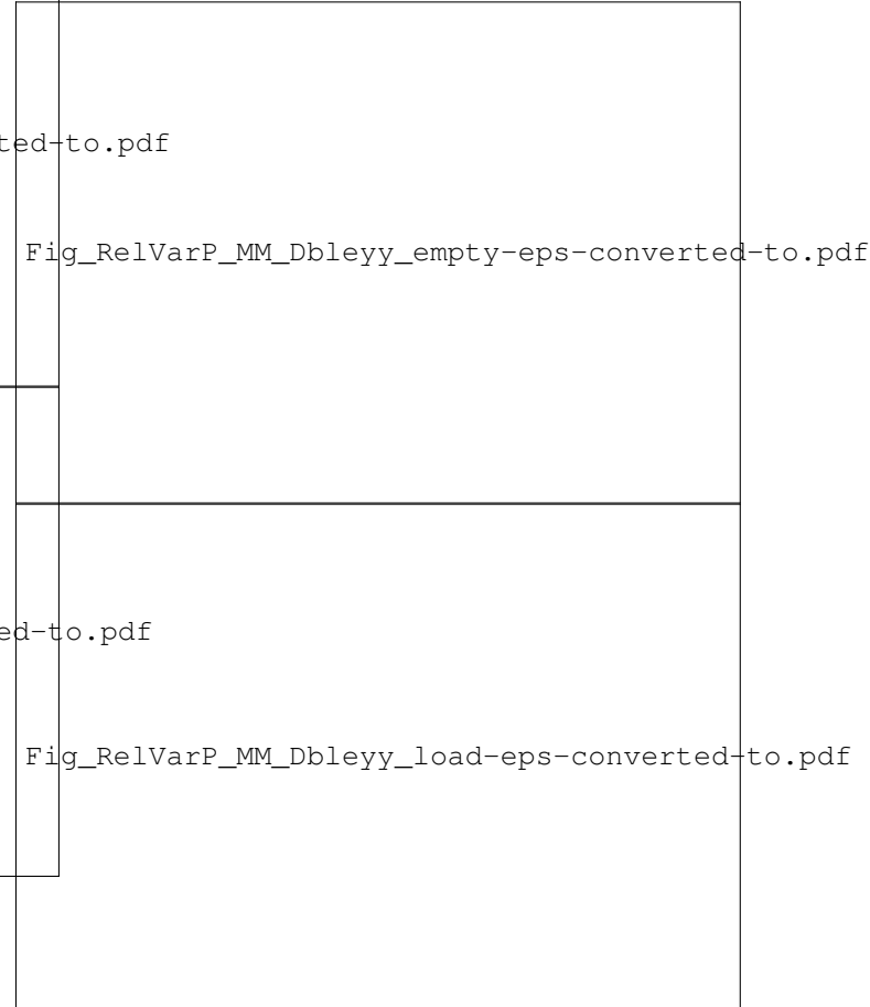
Fig. 2. Estimated normalized relative variance \zeta_P^2 of the electric power as a function of the average number M_M of overlapping modes for the empty case (upper plot) and loaded case (lower plot), respectively. Experimental results (grey line), MC results (black dots) and analytical results (solid line) are reported. Horizontal and vertical bars stand for the 95% confidence intervals related to estimated values of \zeta_P^2 and M_M , respectively.

We observe good agreement between analytical, numerical and experimental results. Note that satisfying agreement between uncertainty bars and experimental fluctuations is also obtained.