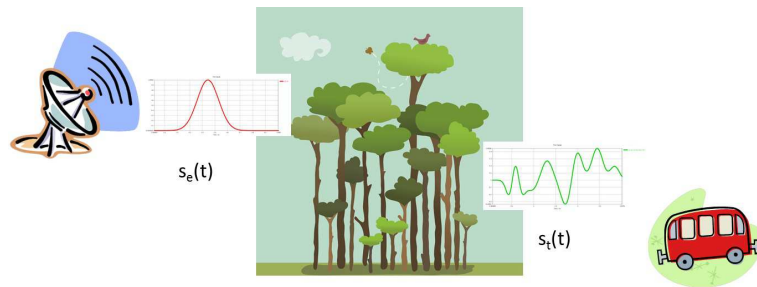
Fig. 1: A radar emits the signal s_e(t) which the forest modifies to s_t(t) before it reaches the target.

In this paper, we first recall the work we performed on a forest of trunks with a kriging metamodel for forest descriptive parameters retrieval. Then we turn to the new technique we propose to implement this work to the case of a forest of branches and trunks and also to support new functions. One of our objectives is to estimate the impact of uncertainties on forest descriptive parameters on the transfer function.