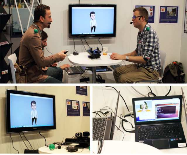
Fig. 2. Real Demo.