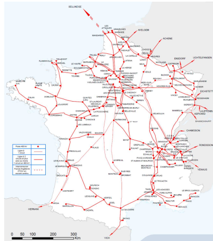
Figure 1. The 400kV French power transmission network

For optimal allocation of link capacity in the network, the NSGA-II algorithm introduced in Section 4 is applied with regarding to the objectives of minimizing cascade vulnerability and investment cost, expressed by Formula (9). The parameters values used in the NSGA-II algorithm are reported in Table 1.