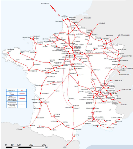
Figure 1. The 400kV French power transmission network

For optimal allocation of link capacity in the network, the NSGA-II algorithm introduced in Section 4 is applied with regarding to the objectives of minimizing cascade vulnerability and investment cost, expressed by Formula (9). The parameters values used in the NSGA-II algorithm are reported in Table 1.