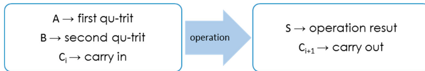
Figure 2. General arithmetic operation diagram in a qu-trit system.

The expressions obtained here above show the symmetry between multiplication and division.