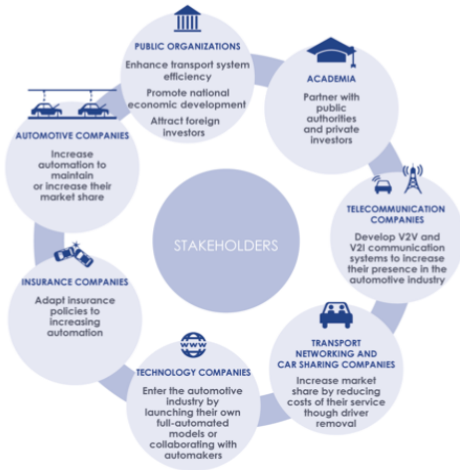
Figure 02: Stakeholders involves in urban mobility future.

It is important to emphasize that it is not only vehicles manufacturers that are being benefited by the advancement of urban mobility, but the economic system as a whole. Corresponding telecommunication companies, shared vehicles services, technology and insurance companies will all have new services and demands from the synergy generated by the Quintuple Helices