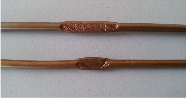
Fig. 2: Partially crushed semi-rigid coaxial cables used for creating the two faulty samples for the experimental validation of the TR-MUSIC approach where the fault's reflection coefficient increases with an increase in the crushed area.