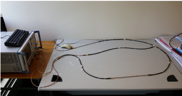
Fig. 3: The experimental setup of the double fault single Y-junction cable network of Fig. 1 (b), which shows the NUT's extremities connected to the vector network analyzer ZVB8 VNA.

Consequently, a singularity will be produced at each scatterer position which is basically obtained at each single frequency of the total applied bandwidth. Accordingly, a good spatial resolution of the scatterers' positions can be still acquired even using narrow bandwidths, an important feature provided by TR-MUSIC compared to other time domain fault detection techniques [6], [7], [24].