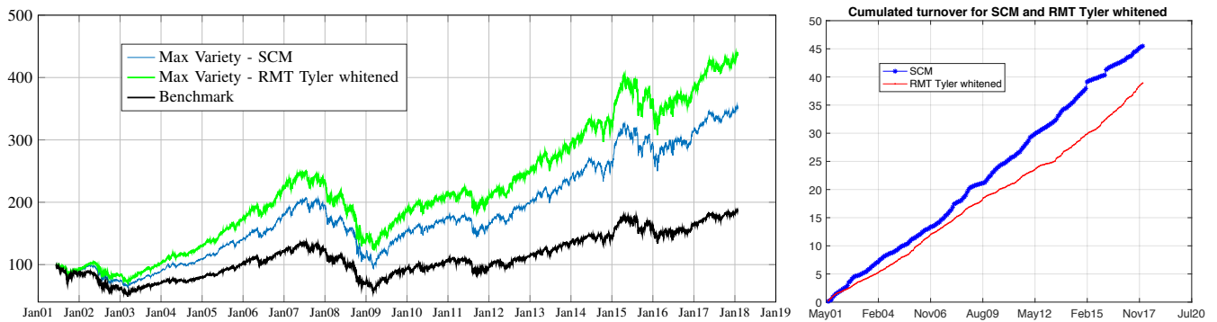
Fig. 2. Left: portfolios wealth starting at 100 at the first period. Right: cumulative sum of absolute weight changes (turnover) between the consecutive periods.