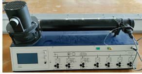
FIG. 1: Instrumented heat blower. The actuators (blower fan and heating resistance) are situated on the left of the picture, while the flow meter and thermocouple are on the right.