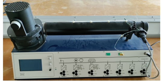
Fig. 1. Instrumented heat blower. The actuators (blower fan and heating resistance) are situated on the left of the picture, while the flow meter and thermocouple are on the right.