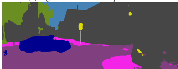
(c) Segmentation of the true image