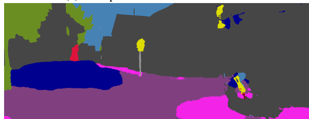
(b) Segmentation of the extrapolated frame