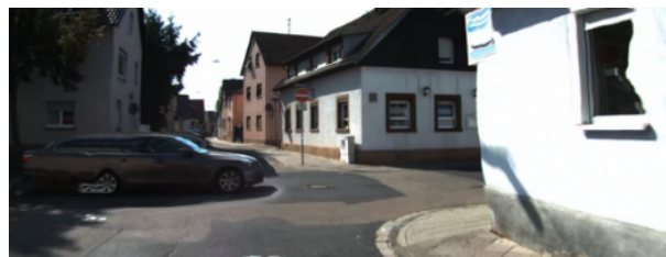
(a) Extrapolated frame with SDCNet

We train the learning-based extrapolation methods, MCNet [19] and SDCNet [20] on the Caltech Pedestrian dataset [21], collected from a vehicle driving through regular traffic in an urban environment. The dataset consists of around 10 hours of dashcam footage with 65 different video sequences captured at 30 fps. We additionally use sequences from the Kitti [22] and DriveSeg [23] manual scene for evaluation purposes which are both datasets taken the same way as Caltech pedestrian from a moving vehicle. We use the sequence #14 from Kitti consisting of 320 frames and the first 500 frames of DriveSeg. Regarding the optical flow-based method FlowNet2 [24], we only make use of the pre-trained weights on MPI-Sintel which is an optical flow data set derived from the film Sintel [25].